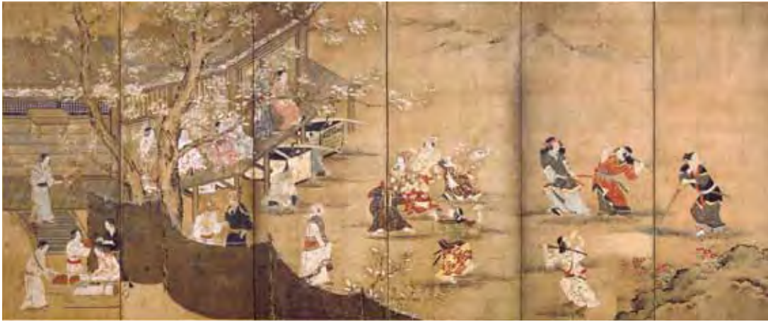
National Treasure Merrymaking under the Cherry Blossoms (left screen) By Kano Naganobu (1577–1654) Tokyo National Museum, on view 4/28–5/17

(By Yamamoto Hideo, Senior Curator of Medieval Paintings; translated by Melissa Rinne)