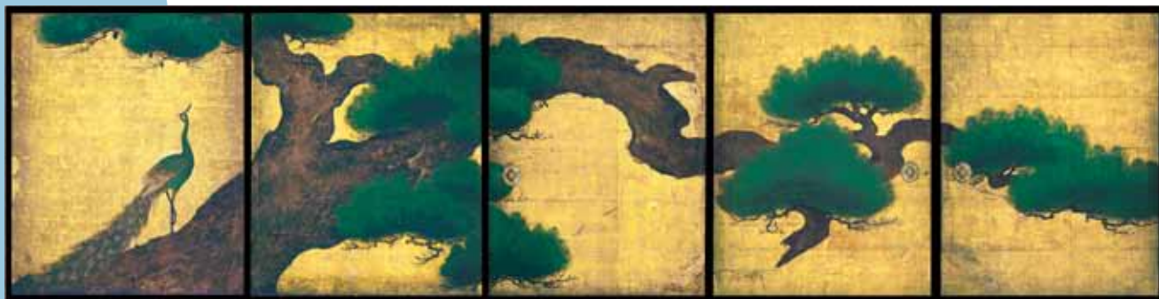
Important Cultural Property Peacock and Pine by Kano Tan'yū (1602–1674) Motorikyū Nijō Castle Office, Kyoto