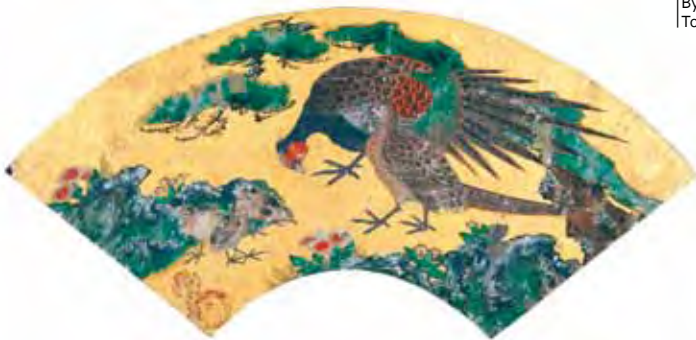
Album of Fan Paintings By Kano Sōshū (1551–1601)