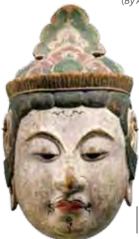
Important Cultural Property Brahmā from Twelve Deva Masks Kyoto National Museum