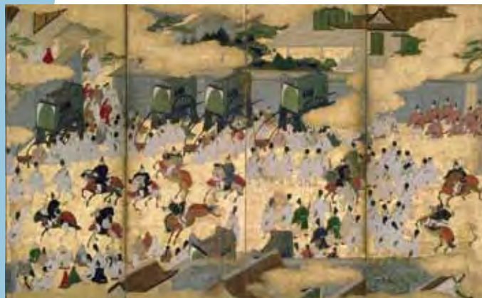
Battle of the Carriages, detail Ninna-ji Temple, Kyoto This screen painting depicts a scene from the "Aoi" chapter of the Heian period novel The Tale of Genji.