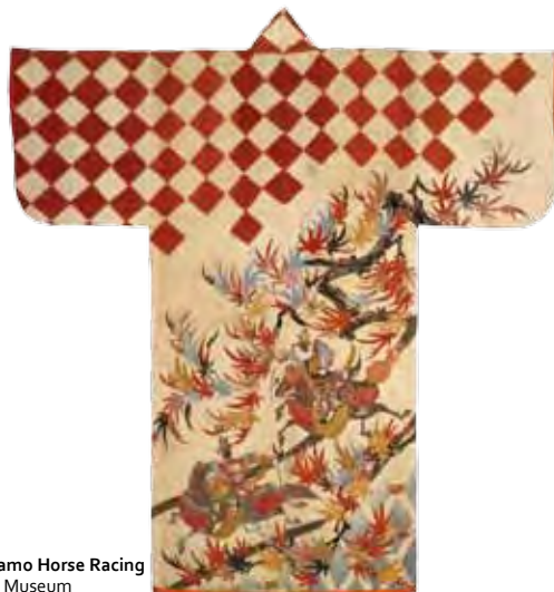
Kosode with Kamo Horse Racing Kyoto National Museum