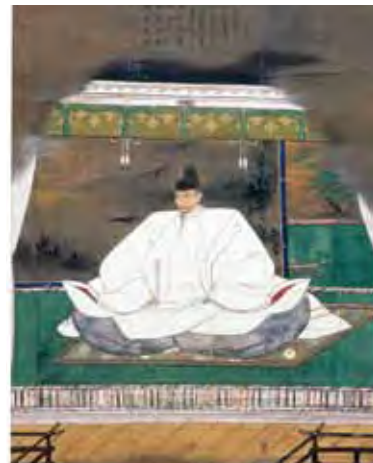
Important Cultural Property Portrait of Toyotomi Hideyoshi, on view 4/7–4/26

This exhibition focuses on the years following Eitoku's death, centering around the Keichō era (1596–1615). Featuring painted masterworks by Eitoku's successors, it traces the changes in aesthetic tastes from bold dynamism to lavish splendor, and eventually to the restrained chic favored by Tokugawa rulers. (Continued on next page.)