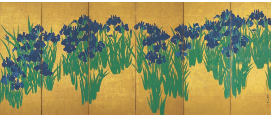
National Treasure Iris , right screen, by Ogata Kōrin (1658–1716) Nezu Museum, Tokyo, on view November 14–26, 2017