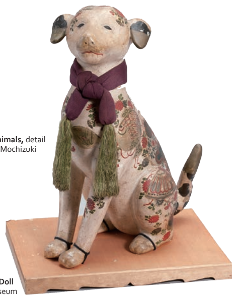
Dog-shaped Saga Doll Kyoto National Museum