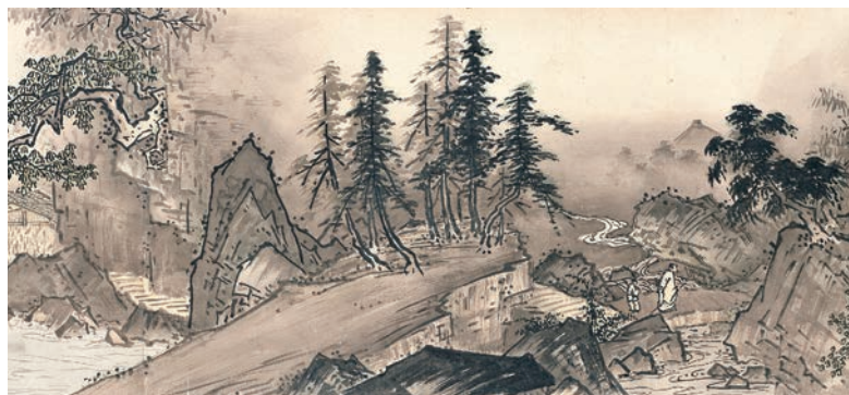
National Treasure Landscape of the Four Seasons (known as the Long Landscape Scroll), detail By Sesshū (1420–1506?) Mōri Museum, Yamaguchi, on view October 3–22, 2017