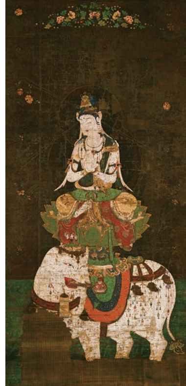
National Treasure Fugen (Samantabhadra) Bodhisattva Tokyo National Museum, on view October 3–29, 2017