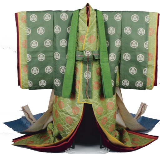
Lady's Formal Court Costume (J., Itsutsuginu Karaginū Mo ), worn by Princess Setsuko of Chichibu Kyoto National Museum