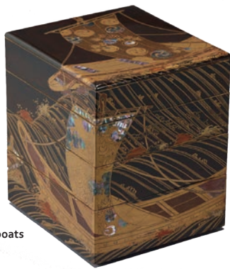
Tiered Food Box with Sailboats Kyoto National Museum