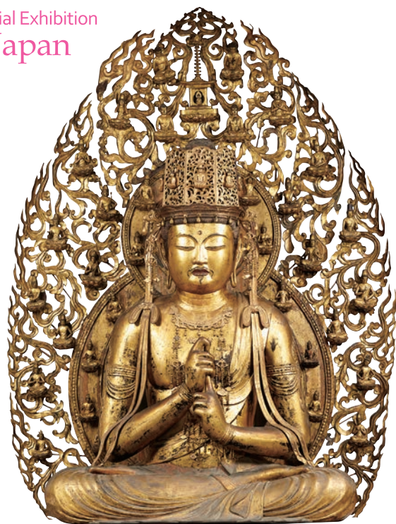
National Treasure Seated Dainichi (Mahāvairocana) Buddha Kongō-ji Temple, Osaka