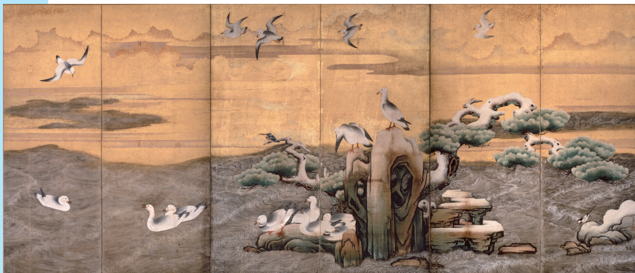
Important Cultural Property Waterfowls by Snowy Shore , right screen, by Kano Sansetsu (1590–1651)