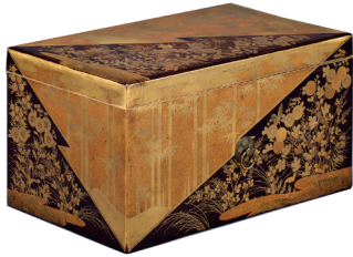
Important Cultural Property Document Box with Bamboo and Autumn Plants in Makie Kōdai-ji Temple, Kyoto