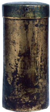
National Treasure Sutra Container of Fujiwara no Michinaga Kinpu Shrine, Nara