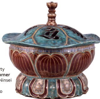
Important Cultural Property Lotus-shaped Incense Burner Attributed to Nonomura Ninsei (dates unknown) Hōkongō-in Temple, Kyoto