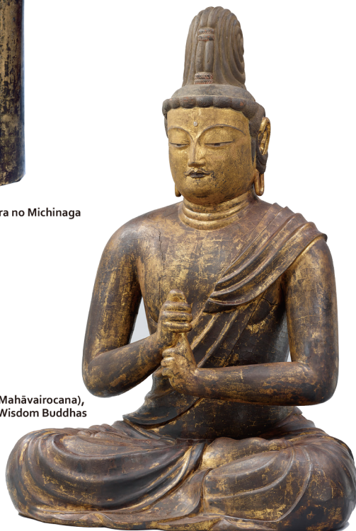
National Treasure Seated Buddha Dainichi (Mahāvairocana), center of the Seated Five Wisdom Buddhas Anshō-ji Temple, Kyoto