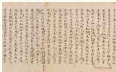
National Treasure Chronicles of Japan (Nihon shoki) , Vol. 22, Iwasaki Version, detail Kyoto National Museum