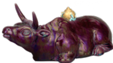
Figurine (Okimono) of a Bull Kyoto ware, Eiraku type; stoneware with polychrome Cochin (Kōchi) glazes By Eiraku Tokuzen (1852–1909) Gift of Kōnoke Zen’uemon, Kyoto National Museum