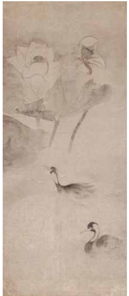
National Treasure Water Fowl in the Lotus Pond By Tawaraya Sōtatsu (dates unknown) Kyoto National Museum