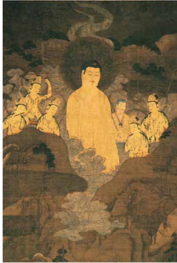
National Treasure Amida (Amitabha) Coming over the Mountain Kyoto National Museum