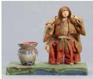
Ishō (Fashion) Doll, Noh Play Shōjō Kyoto National Museum