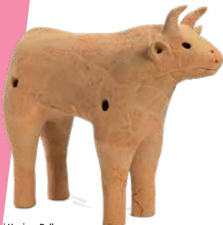
Haniwa, Bull Excavated from Imashirozuka Tumulus, Osaka Imashirozuka Museum, Takatsuki, Osaka