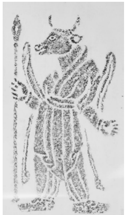
Ox, from the Twelve Animals of the Chinese Zodiac Korea, Gyeongju, Chungghyo-dong Tomb of General Kim Yushin Gift of Umehara Sueji, Kyoto National Museum