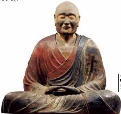
National Treasure Seated Priest Jianzhen (Ganjin) Hollow dry lacquer with pigments Tōshōdai-ji Temple, Nara