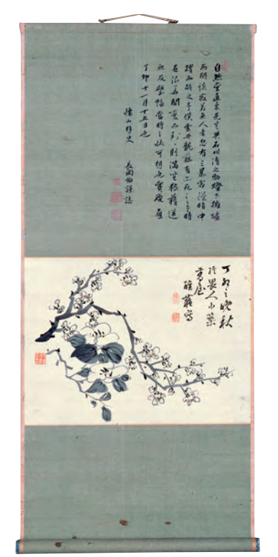
Important Cultural Property Plum Blossoms and Camellias (Stained with the blood of Sakamoto Ryōma, from his assassination) By Itakura Kaidō (1823–1879) Kvoto National Museum

The Arrival of Commodore Matthew Perry's Ships