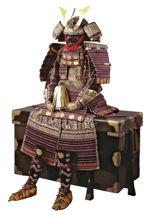
Armor (Yoroi) with Purple Lacings Owned by Shimazu Nariakira (1809 –1858) Kyoto National Museum

Sword ( Katana ), signed "Yoshiyuki" Worn by Sakamoto Ryōma Kyoto National Museum