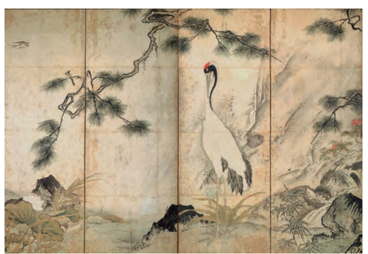
| Important Cultural Property | Birds and Flowers of the Four Seasons, detail | By Sesshū | Kyoto National Museum