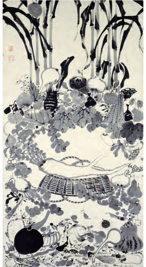
Vegetable Nirvana by Itō Jakuchū