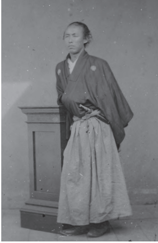
| Photograph of Sakamoto Ryōma

The Arrival of Commodore Matthew Perry's Ships