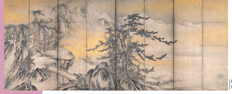
Landscape, left screen By Kaihō Yūshō (1533—1615)