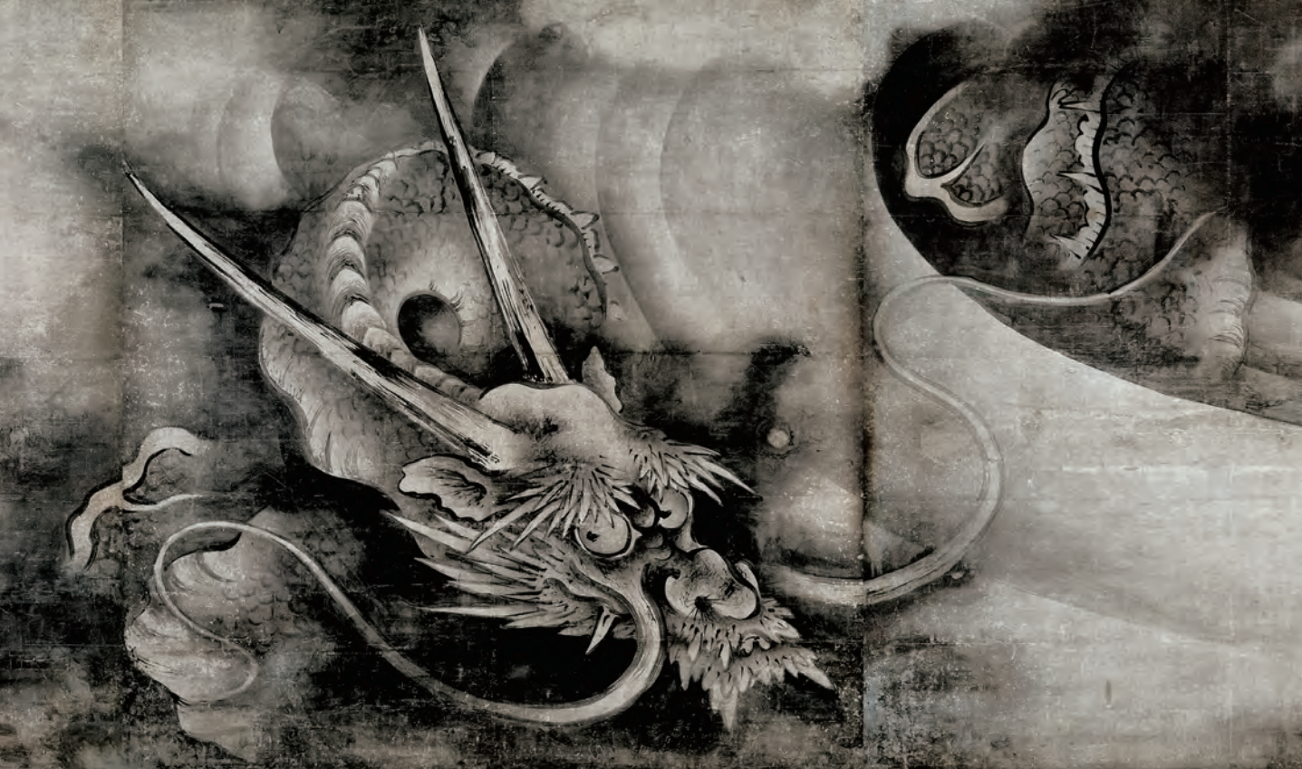
Important Cultural Property Dragons and Clouds, detail, by Kaihō Yūshō (1533–1615) Kennin-ji Temple, Kyoto