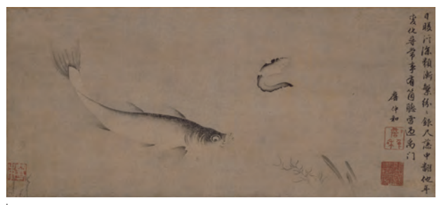
Fish and water-weed, by Tohon, inscription by Zhan Zhoghe Kyoto National Museum