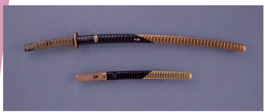
Important Cultural Property Large and Small Mounting with Gold-Plated Scabbard Collected by Naga Fujikazu, Kyoto National Museum

\textit{(By It\bar{o} Shinji, Chair of the Department of Exhibitions and Public Relations; translation by Melissa~M.~Rinne)}