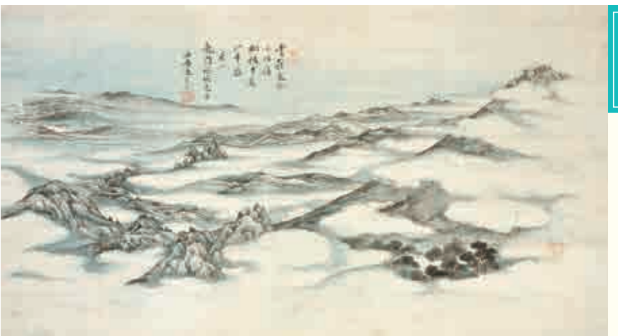
True View of Mount Asama By Ike no Taiga