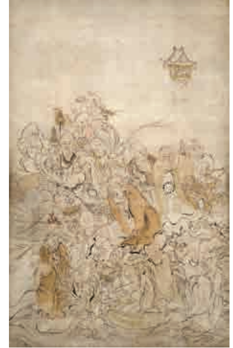
Important Cultural Property Five Hundred Arhats, by Ike no Taiga Manpuku-ji Temple, Kyoto