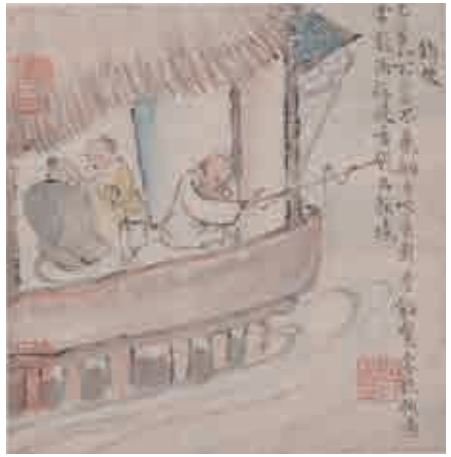
National Treasure The Ten Conveniences and the Ten Pleasures, by Ike no Taiga Kawabata Yasunari Foundation