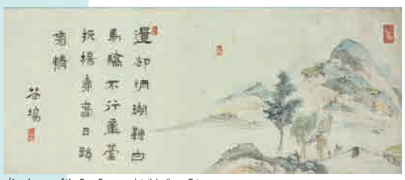
Landscapes of the Four Seasons, detail, by Ike no Taiga MOA Museum of Art