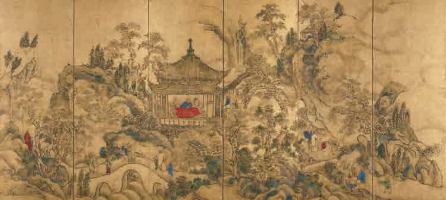
National Treasure Landscape with Pavilions, left screen, by Ike no Taiga Tokyo National Museum, on view May 2–20, 2018