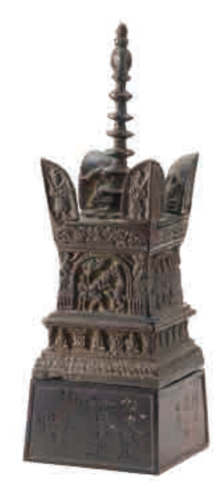
| Pagoda (from the 84,000 pagodas of Qian Hongchu) | Kyoto National Muesum

National Treasure Book of Han, Biography of Yang Xiong, Vol. 57, detail Kyoto National Muesum