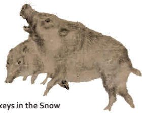
Wild Boars, Deer, and Monkeys in the Snow By Mori Sosen Kōsei-in Temple, Kyoto