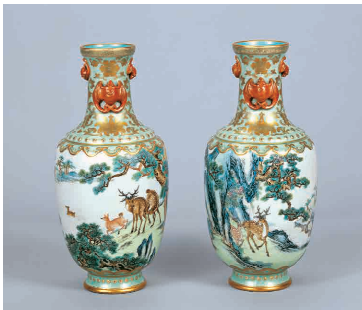
Bottle with Pine Tree and Deer Kyoto National Museum