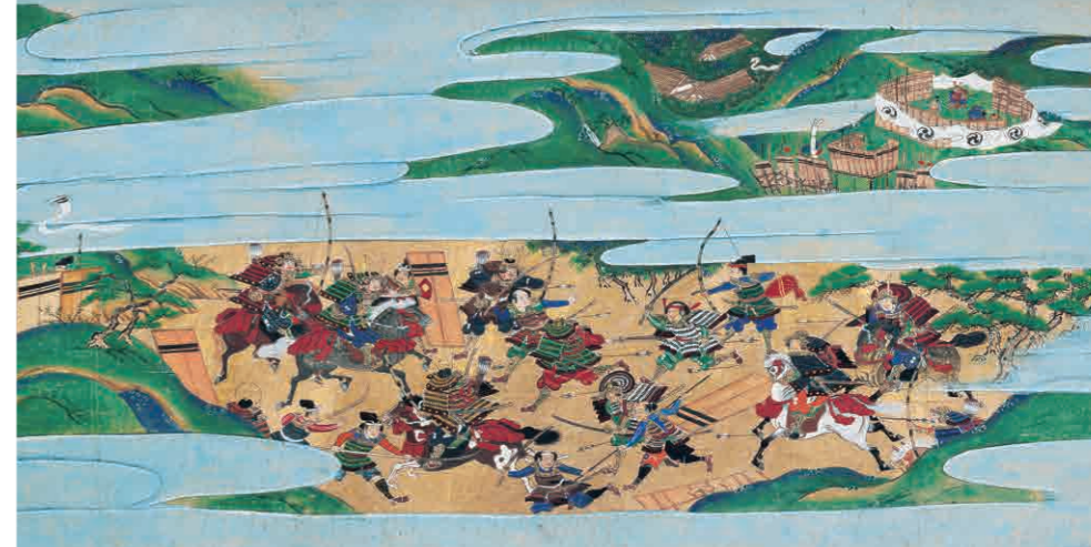
Important Cultural Property Legends of Shinnyodō, Vol. 3 Painting by Kamonnosuke Hisakuni Shinshō Gokuraku-ji Temple, Kyoto