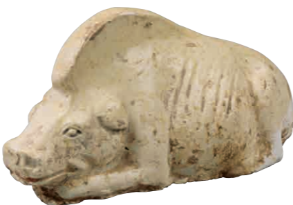
White Boar Kyoto National Museum