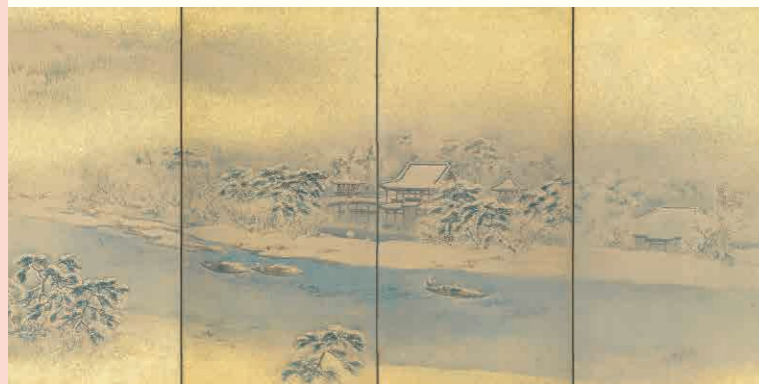
Byōdō-in Temple in the Snow, detail By Shiohawa Bunrin Kyoto National Museum

This exhibition features works with scenes of the ancient capital in the snow.