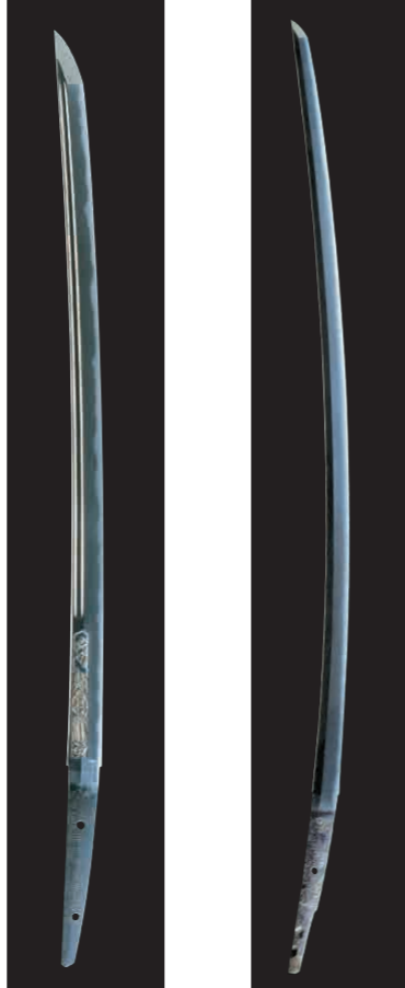
Important Cultural Property Long Sword (Katana) By Umetada Myōju Kyoto National Museum