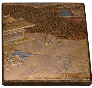
Inkstone Case with Poetic Scene of Sumiyoshi Wood with lacquer and makie (sprinkled metallic powder) decoration Gift of Okumura Jūbei, Kyoto National Museum