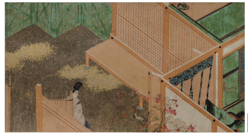
Important Cultural Property Illustrated Tales of Ise, detail Kuboso Memorial Museum of Arts, Izumi, Osaka [on view November 12–24, 2019]