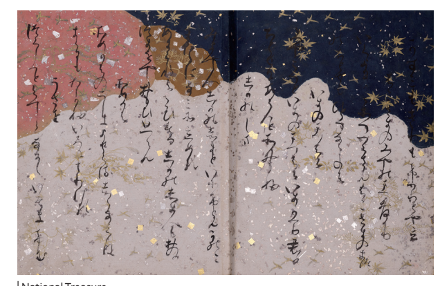
National Treasure "Shigeyuki shū" (Collected Poetry of Minamoto no Shigeyuki) from Sanjūroku nin kashū, detail (Anthology of Poems by the Thirty-six Immortal Poets)

Lacquered wood with makie (sprinkled metallic powder) decoration; wood