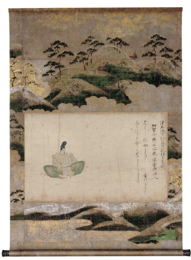
Important Cultural Property Sakanoue no Korenori from The Thirty-Six Immortal Poets , Satake Version Attributed to Fujiwara no Nobuzane (1176–1265) Inscription attributed to Gokyögoku Yoshitsune (1169–1206) Agency for Cultural Affairs