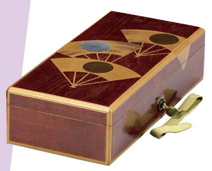
Box full moon and fan crestand other original storage boxes for the scrolls of The Thirty–six Immortal Poets , Satake version

Lacquered wood with makie (sprinkled metallic powder) decoration; wood