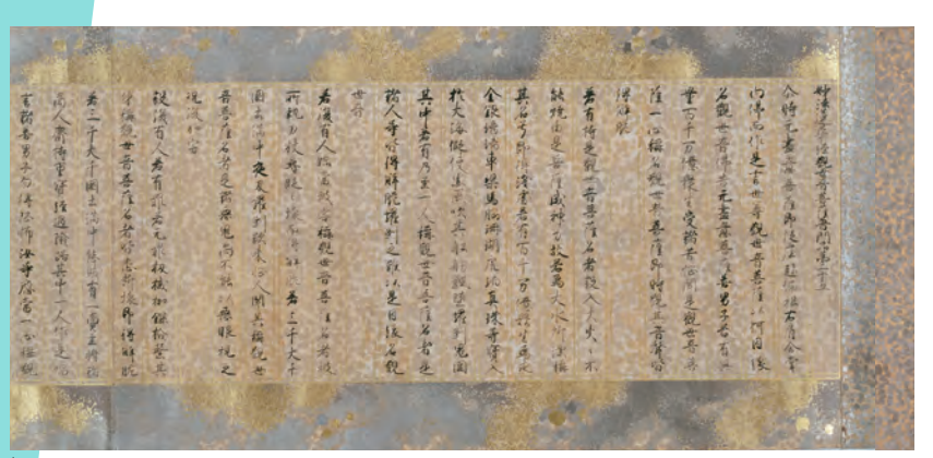
Hokke ippongyō (Lotus Sutra Copied in Single Volume per Chapter), Chapter 25 "The Universal Gate of Bodhisattva Kannon" (from the scriptures of Hase-dera Temple). Hase-dera Temple, Nara. National Treasure. Detail. (On view August 18–September 13, 2020.)