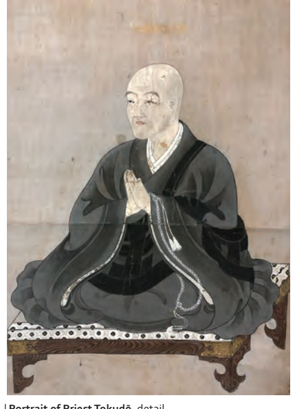
Portrait of Priest Tokudō , detail Hokki-in Temple, Nara