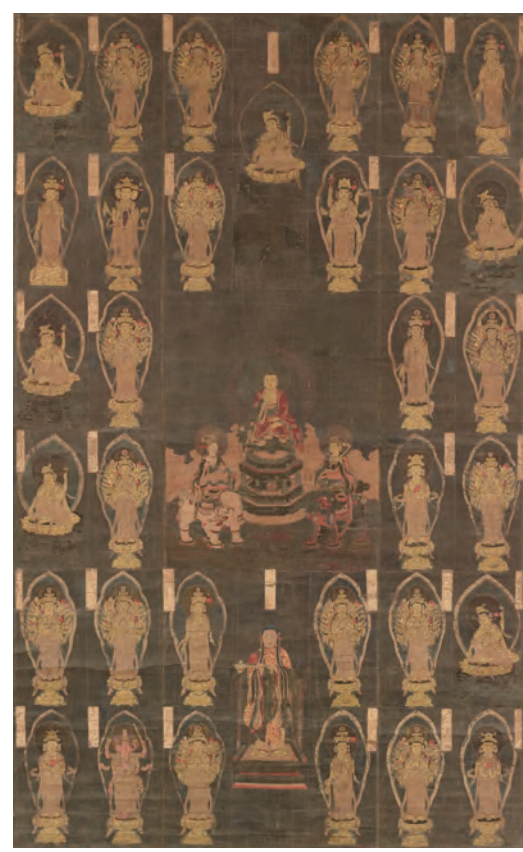
Mandala of the Images of Kannon from the Thirty-three Pilgrimage Sites. Kannonshō-ji Temple, Shiga. (On view July 23–August 16, 2020.)

Seated Nyoirin Kannon (Skt., Cintāmaṇicakra Avalokiteśvara) Wood with polychromy, Chōhō-ji (Rokkaku-dō) Temple, Kyoto.