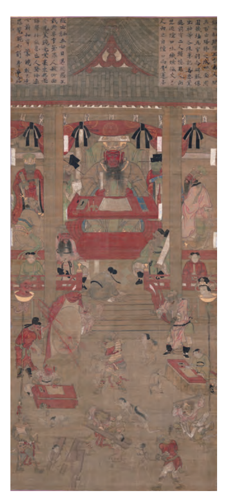
Rokudō-e (Six Realms of Rebirth) Shōju Raigō-ji Temple, Shiga. National Treasure. (On view August 18–September 13, 2020.)