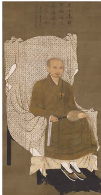
Important Cultural Property Portrait of Vinaya Master Shunjō Inscription by Shunjō (1166–1227) Mitera Sennyū-ji Temple, Kyoto