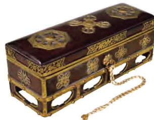
Important Cultural Property Box for Ordination Documents Lacquered wood with gilt bronze fittings Kongō-ji Temple, Osaka, on view April 20–May 16