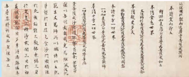
National Treasure Enchin's Ordination Certificate, from Documents Related to Enchin , detail Tokyo National Museum, on view March 27–April 18