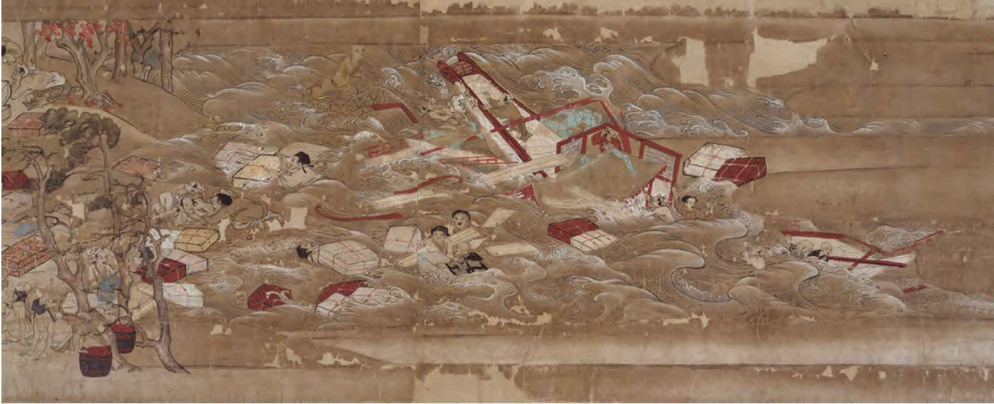
Important Cultural Property Eastern Journey of the Priest Jianzhen ( Tōseiden emaki ), Vol. 2, detail By Rengyō (dates unknown) Tōshōdai-ji Temple, Nara, this scene on view March 27–April 18