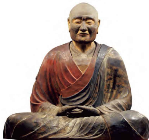
National Treasure Seated Jianzhen (Ganjin Wajō) Hollow dry-lacquer with pigments Tōshōdai-ji Temple, Nara