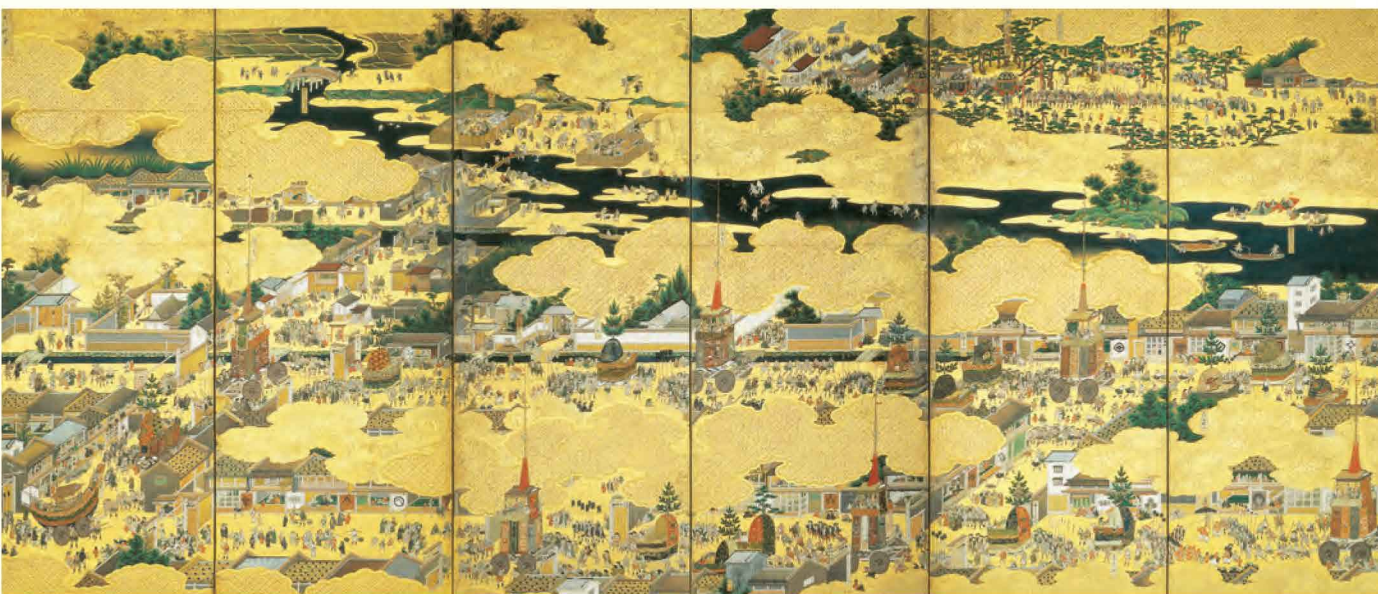
The Gion Festival (right screen) Kyoto National Museum