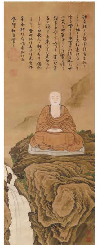
Jun in Seated Meditation on a Rock By Hara Zaichū (1750–1837) Inscription by Jun (1718–1805) Kōki-ji Temple, Osaka, on view March 27–April 18