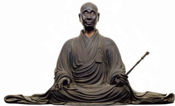
National Treasure Seated Portrait of Eison ( Kōshō Bosatsu ) By Zenshun (dates unknown); wood with pigments Saidai-ji Temple, Nara, on view April 20–May 16