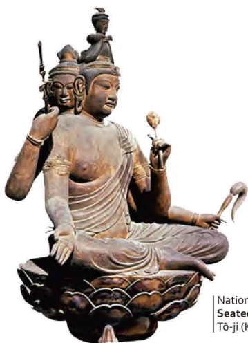
National Treasure Seated Bonten (Brahman) Tō-ji (Kyōōgokoku-ji) Temple, Kyoto

July 24–September 12, 2021, Heisei Chishinkan Wing