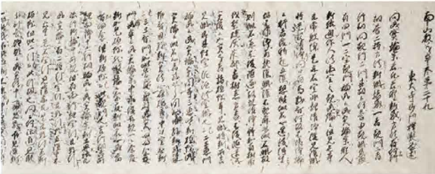
Important Cultural Property Doctrines of the Southern Mountain (Ch: Nanshan jiaoyi zhang ), Vol. 29 (Transcribed on the Reverse of Volume 21 of Zhiyu's ), detail, by Gyōnen (1240–1321) Moriya Kōzō Collection, Gift of Moriya Yoshitaka, Kyoto National Museum