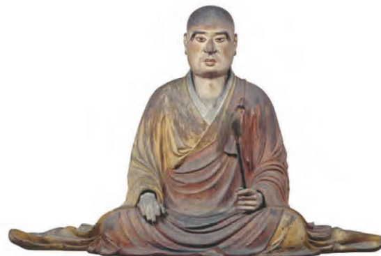
Important Cultural Property Seated Portrait of Daihi Bosatsu (Kakujō) By Jōkei (dates unknown); wood with pigments Tōshōdai-ji Temple, Nara