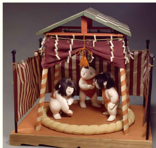
Gosho (Palace) Dolls, Sumo Wrestlers Wood with shell white ( gofun ), ink, pigments, silk, et al. Kyoto National Museum