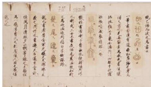
Important Cultural Property Catalogue of Early Chinese Characters (Ch., Zhuanli wenti) , detail Handscroll, ink on paper Bishamondō Temple, Kyoto