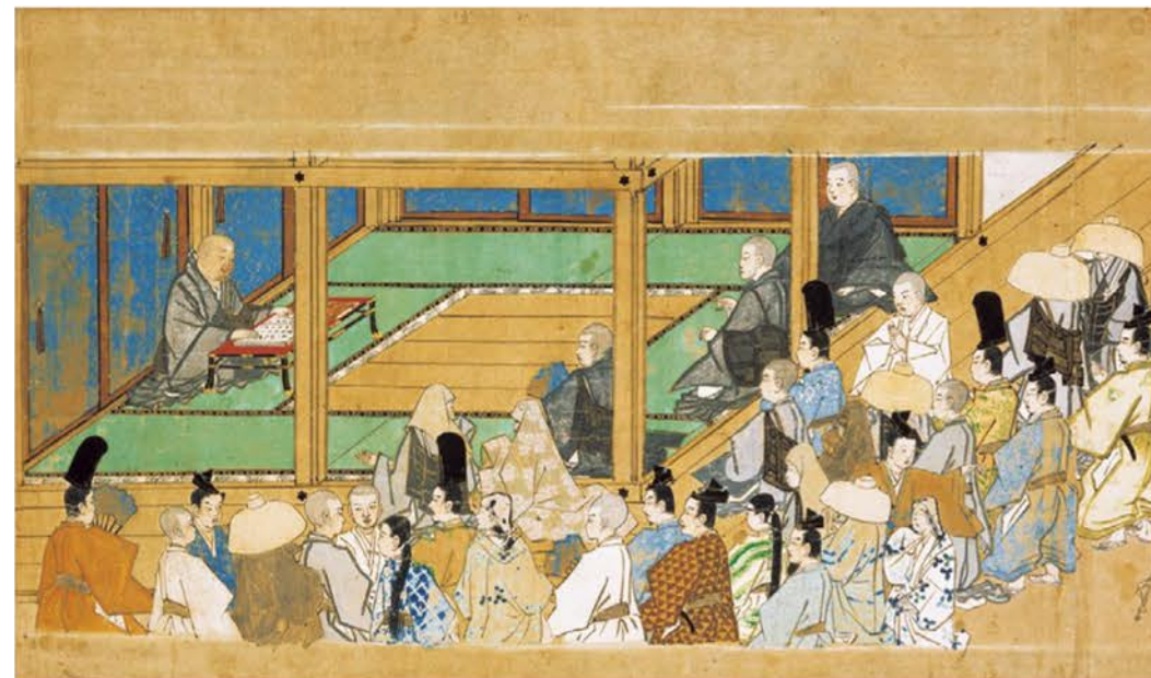
National Treasure Illustrated Biography of Master Hōnen (Hōnen Shōnin e-den), Volume 6, detail One of forty-eight handscrolls; ink and colors on paper Chion-in Temple, Kyoto, this scroll on view October 8–20, 2024