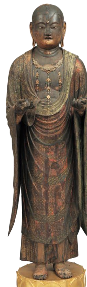
Important Cultural Property Standing Jizō (Kṣitigarbha) Bodhisattva Wood with pigments and cut gold leaf, rock crystal eyes Saikō-ji Temple, Aichi