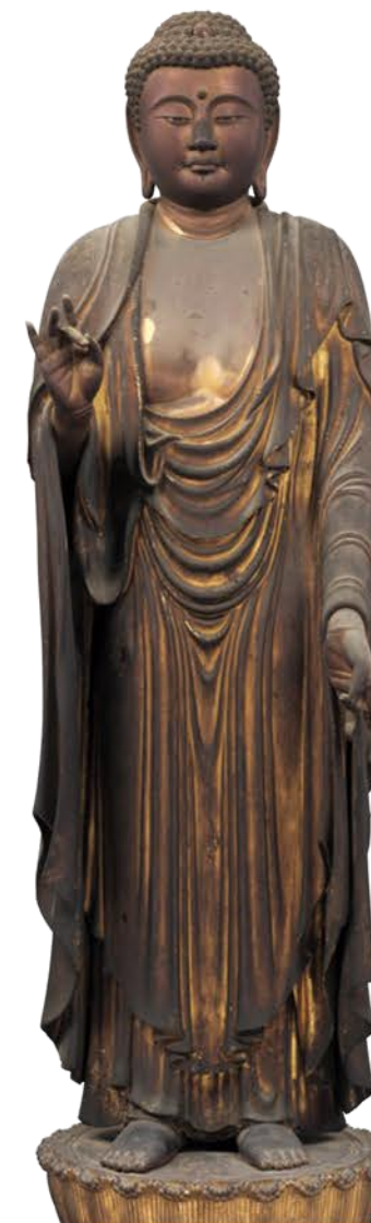
Standing Amida (Amitābha) Buddha Wood with lacquer and gold foil, rock crystal eyes Hyakumanben Chion-ji Temple, Kyoto