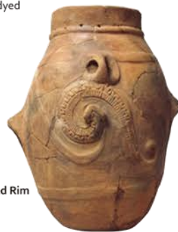
Deep Vessel with Perforated Rim Earthenware Kyoto National Museum