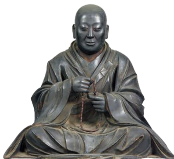
Important Cultural Property Seated Portrait of Master Hōnen Wood with pigments and rock crystal eyes Taima-dera Oku-no-in Temple, Nara On view October 8–November 4, 2024