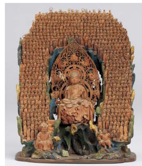
Important Cultural Property Thousand Jizō (Kṣitigarbha) Bodhisattvas in Portable Altar Lacquered wood Hōon-ji Temple, Kyoto