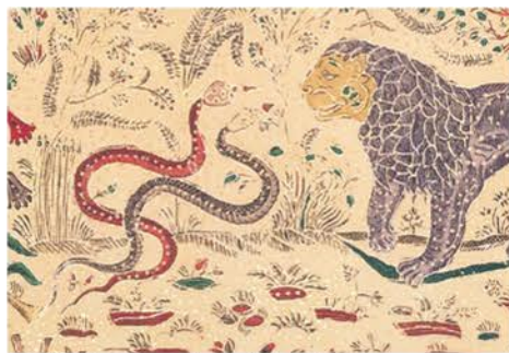
Textile with Lions, Snakes and Flowering Plants, detail Cotton plain weave; painted, mordant and resist dyed Kyoto National Museum