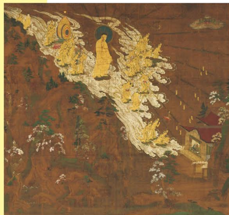
National Treasure Welcoming Descent of Amida (Amitābha) and Twenty-five Bodhisattvas, Known as Haya Raigō (the "Rapid Welcoming Descent") Hanging scroll; ink and colors on silk Chion-in Temple, Kyoto On view November 6–December 1, 2024

(By Inami Rintarō, Curator of Japanese Illustrated Handscrolls)