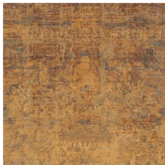
National Treasure Taima Mandala, detail Hanging scroll; silk tapestry weave Taima-dera Temple, Nara On view November 12–December 1, 2024