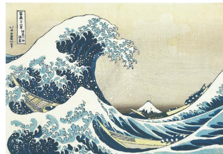
"Under the Wave off Kanagawa," also known as "The Great Wave," from the series Thirty-six Views of Mount Fuji . By Katsushika Hokusai (1760–1849). Japan, Edo period, ca. 1831. Woodblock print; ink and colors on paper. Hagi Urugami Museum, Yamaguchi (on view April 19–May 18, 2025; same print from the Kuboso Memorial Museum of Arts, Izumi, on view May 20–June 15, 2025)