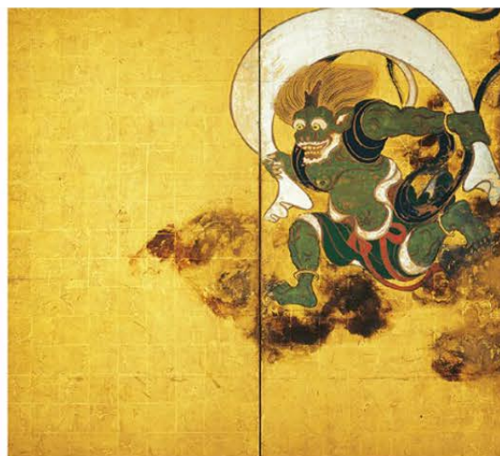
National Treasure. Wind God and Thunder God. By Tawaraya Sōtatsu (n.d.). Japan, Edo period, 17th century. Pair of two-panel folding screens; ink, colors, and gold foil on paper. Kennin-ji Temple, Kyoto