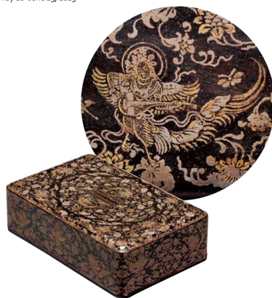
National Treasure. Book Box with Buddhist Flowers and Kalaviṅka Birds. Japan, Heian period, 919. Dry lacquer with makie (sprinkled metallic powder) decoration. Ninna-ji Temple, Kyoto