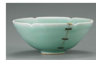
Tea Bowl with Foliate Rim, Named "Kasugai" (Clamps) China, Southern Song dynasty, 13th century Longquan ware, porcelain with celadon glaze Maspro Art Museum, Aichi