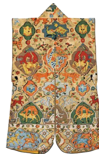
Important Cultural Property Surcoat (Jinbaori) with Bird and Animals Owned by Toyotomi Hideyoshi (1537–1598) (Tailoring) Japan, Momoyama period, 16th century. (Textile) Persia, Safavid dynasty, 16th century. Silk tapestry weave. Kōdai-ji Temple, Kyoto. On view April 19–May 11, 2025