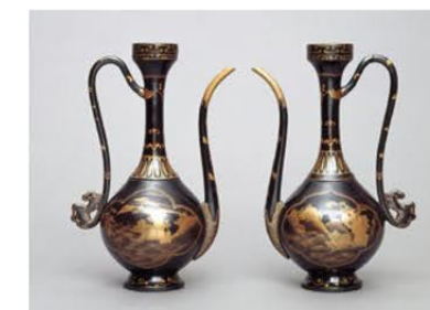
Pair of Ewers with Landscapes Japan, Edo period, 18th century Lacquered wood with makie (sprinkled metallic powder) decoration Kyoto National Museum