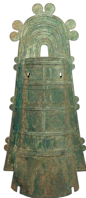
Important Cultural Property. Dōtaku (Bronze Bell) with Protruding Lines, Type 5. Excavated from Oiwayama, Koshinohara, Yasu, Shiga. Japan, Yayoi period, 1st–3rd century CE. Cast bronze. Tokyo National Museum