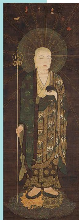
Jizō (Kṣitigarbha) Bodhisattva Japan, Kamakura period, 14th century Hanging scroll; ink and colors on silk Tokyo National Museum On view May 20–June 15, 2025