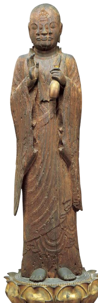
Important Cultural Property. Standing Priest Baozhi (Hōshi). Japan, Heian period, 11th century. Wood. Saiō-ji Temple, Kyoto