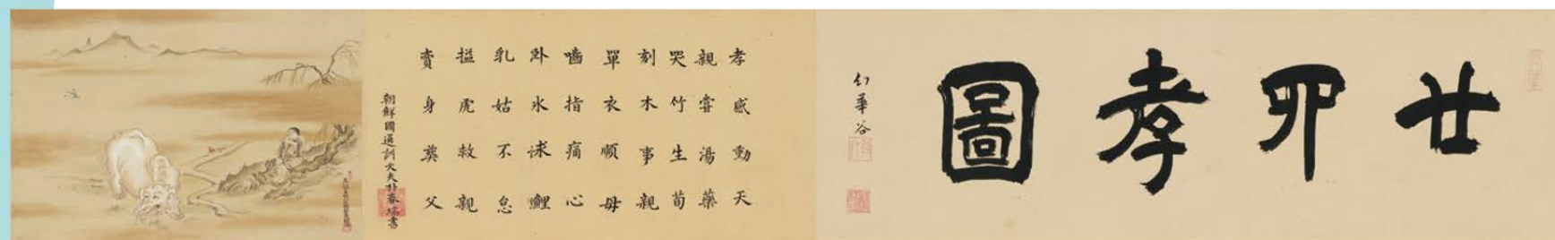
Twenty-four Paragons of Filial Piety By Tosa Mitsusuke (1675–1710) and others Japan, Edo period, 18th century One from a set of five handscrolls; ink and colors on paper