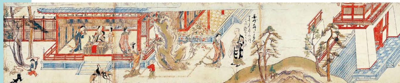
National Treasure. "Biography of Uisang," from Illustrated Biographies of the Kegon (Huayan) School Founders Japan, Kamakura period, 13th century. One from a set of four handscrolls; ink and colors on paper. Kōsan-ji Temple, Kyoto. This scene on view May 20–June 15, 2025