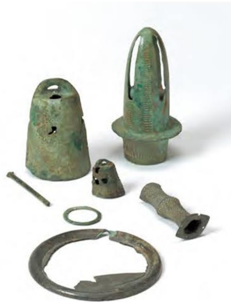
Objects Excavated from the Ipsil-ri Site Bronze. Excavated from Ipsil-ri, Gyeongju, South Korea Korea, early Iron Age, 1st century BCE Tatsuuma Collection of Fine Arts, Hyogo