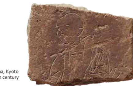
Tile Incised with Monk Earthenware Excavated from Bon'yama, Kyoto Japan, Heian period, 12th century Kyoto National Museum