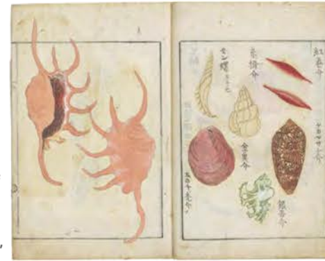
Illustrated Catalogue of Curious Shells By Kimura Kenkadō (1736–1802) Japan, Edo period, 18th century Book; ink and colors on paper Tatsuuma Collection of Fine Arts, Hyogo