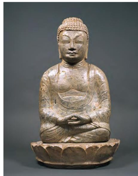
Important Cultural Property Seated Miroku (Maitreya) Buddha Stone. Excavated from the Hachigatamine Sutra Mound, Nagasaki Japan, Heian period, 1071 Nara National Museum