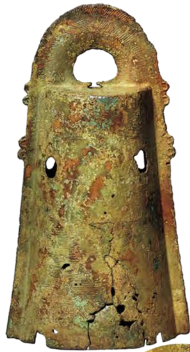
Important Cultural Property Dōtaku Ritual Bell with Flowing Water Pattern Cast bronze. Excavated from Inomukai, Fukui, Japan, Middle Yayoi period, 3rd–1st century BCE Tatsuuma Collection of Fine Arts, Hyogo