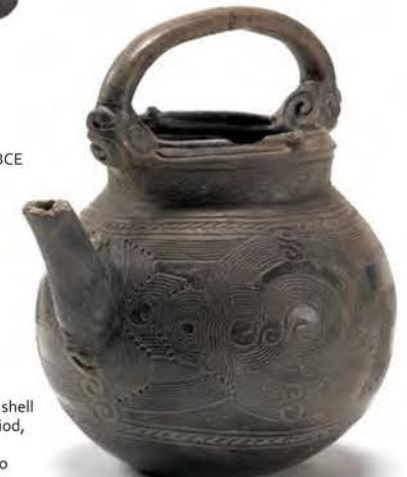
Important Cultural Property Spouted Vessel Earthenware. Excavated from Shiizuka shell mound, Ibaraki, Japan, Late Jōmon period, 25th–13th century BCE Tatsuuma Collection of Fine Arts, Hyogo