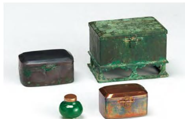
National Treasure Votive Objects from the Foundation Stone of the Sūfuku-ji Pagoda Excavated from the remains of Sūfuku-ji Temple, Shiga Japan, Asuka period, 7th century Ōmi Jingū Shrine, Shiga