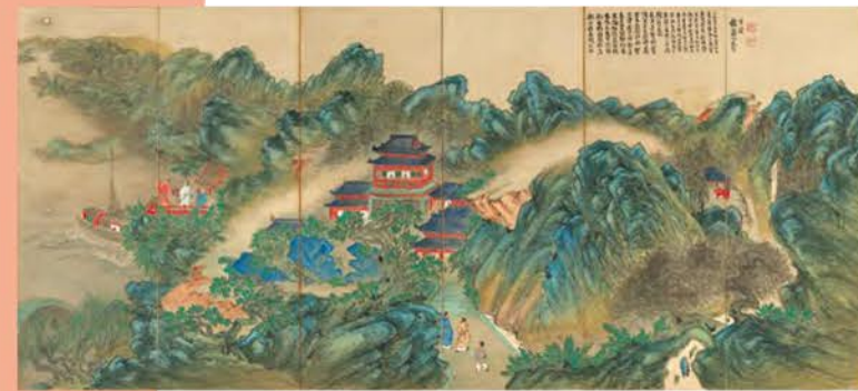
Important Cultural Property Abe no Nakamaro Gazing at the Moon in Mingzhou By Tomioka Tessai (1836–1924) Japan, Taishō period, 1914 One from a pair of six-panel folding screens Ink and colors on silk Tatsuuma Collection of Fine Arts, Hyogo (on view August 11–September 6, 2026)