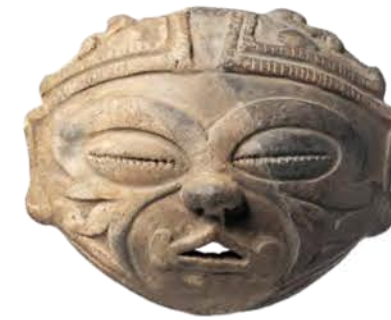
Mask Earthenware. Excavated from Ōhara, Iwate Japan, Final Jōmon period, 13th–4th century BCE Tatsuuma Collection of Fine Arts, Hyogo